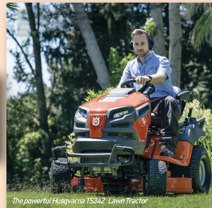
The powerful Husqvarna TS342 Lawn Tractor

Get the job done, no matter what. Thanks to a wide range of attachments and a built in choice of cutting methods, a Husqvarna garden tractor offers great usability and becomes a powerful partner in your garden all year round. It's ideal for efficient lawn care and various tasks on your land.