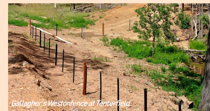
Gallagher's Westonfence at Tenterfield.

The result is a strong electrified fence, designed to reduce the chance of faults and shorts with your choice of design to withstand sheep, cattle, horses, deer, wild dogs and pigs.