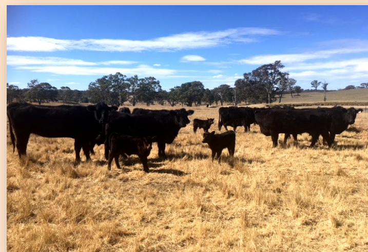
Pictured: Angus cows & calves at "The Ridge". "We Dectomax everything here, the Spring rise is the key time to treat". Grant Macnamara NTR Pastoral Company.

"Animal health is our lowest input cost on farm". "It's a cheap insurance policy on an income producing asset, cows and calves on the ground utilising improved pasture equals more kilos per hectare". "If I can tighten up calving patterns and prevent a few losses it means we are ahead of the game".