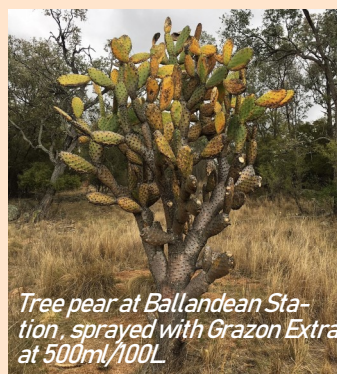
Tree pear at Ballandean Station, sprayed with Grazon Extra at 500ml/100L.